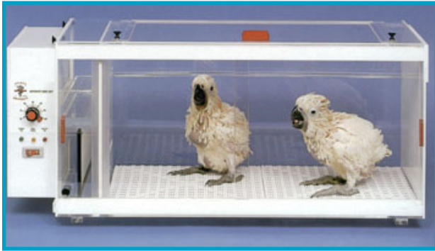
The Standard Animal Intensive Care Unit, (AICU)

Inside Dimensions: 24" x 12" x 12" Outside Dimensions: 31 3/8 x 14 1/2" x 13"