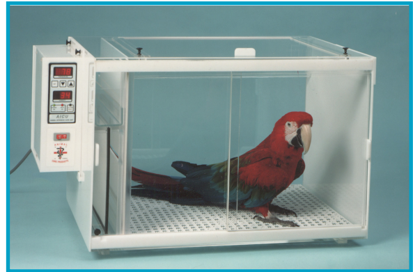
P.S. Bird Not included